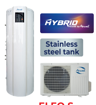
ELEO S Split thermodynamic water heater